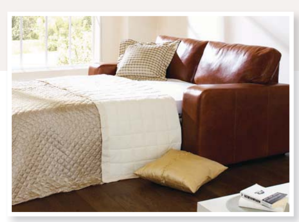
Bronx 3 Seater Sofa Bed – Aniline Tan

Bronx Sofa Bed Dimensions Reg Sleeping Area – 180cm x 115cm Large Sleeping Area – 180cm x 133cm Max area required to fully extend the Sofa Bed – 240cm