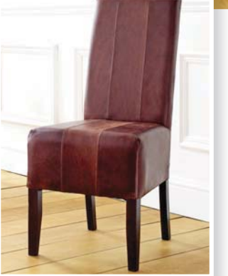
Nevada Dining Chair – Forest Brown Distressed Aniline