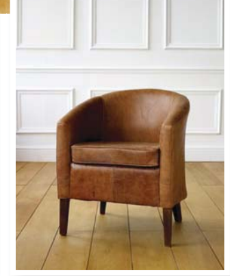
Est Tub – Semi-Aniline Tan